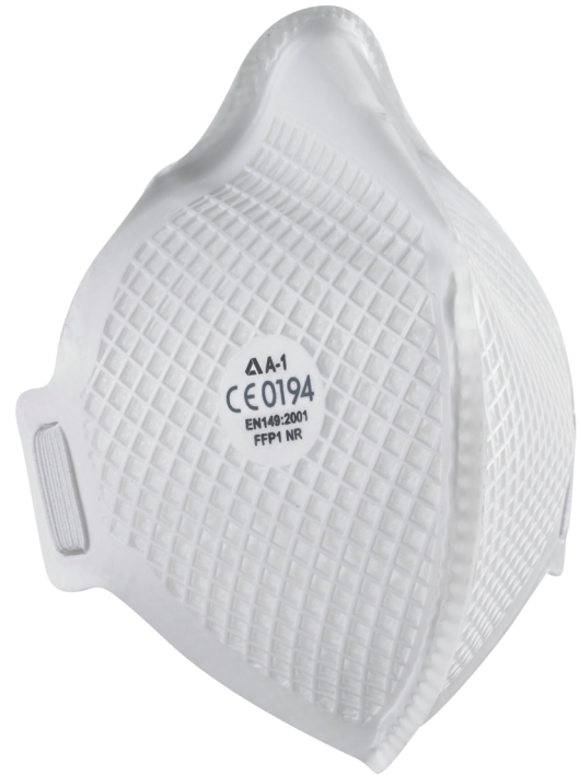
PREFORMED NOSEBRIDGE Ensures continuity of fit